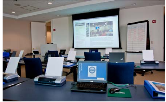
The communications and media lab allows for instructor and student interaction