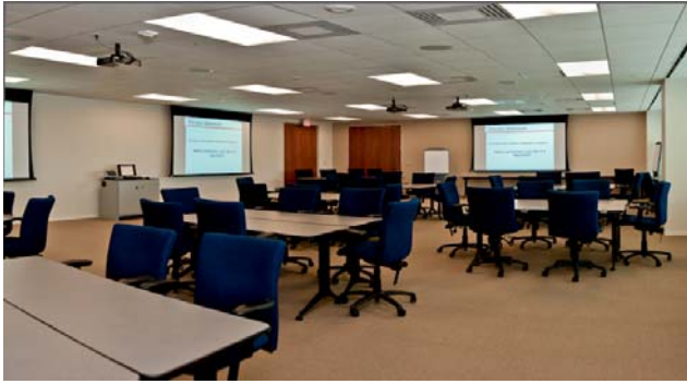
The large training room uses multiple projection display configurations. This allows the room to be used for smaller collaborative groups or as one large instructional environment.