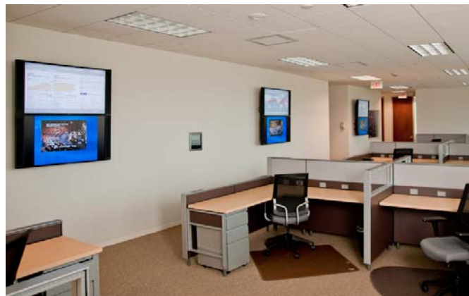
Development and Operations Overflow Room utilizes multiple screens which can view the various display outputs of the OPS center's video display wall.