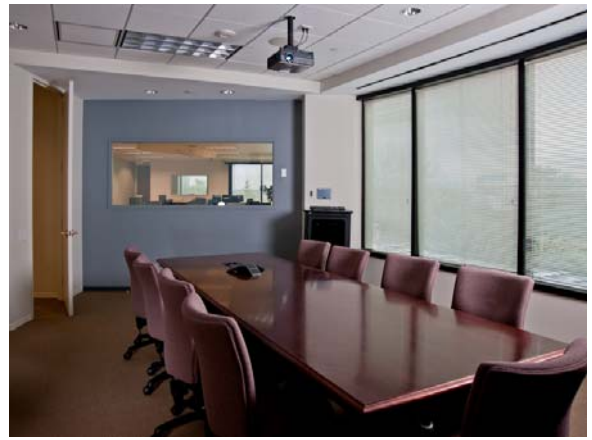
Strategy and Conference Room utilizes computer and various media inputs along with conferencing capabilities. Viewing of operations can also be done through electronic privacy glass.